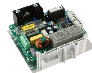
CIRCUIT CV6F/CV8F PV CV6FX D2 STD