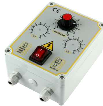
PLASTIC BOX CV6/F PV CV6FX Z2 STP 165x130x70