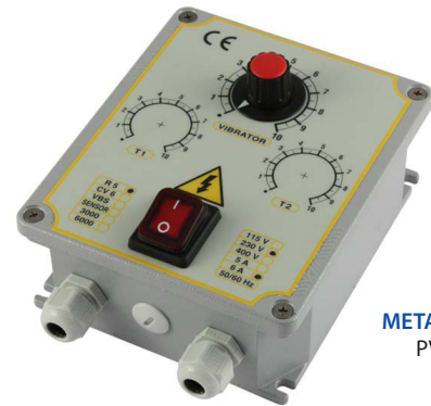
METALLIC BOX CV6F PV CV6FX Z2 STM 165x140x65