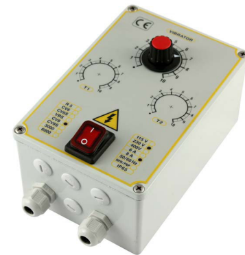
METALLIC BOX CV6F/CV8F PV CV8FX Z2 SM1 PV CV10F Z2 SM1 PV CV12F Z2 SM1 195x130x90