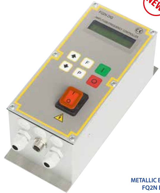
METALLIC BOX FQ2N DIG PV FQ2DI Z2 STD 100x210x70