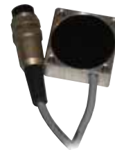
SENSOR SIND3 PV SIND3 A2 STD